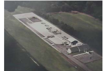
Aerial View of SHRWD's wastewater treatment plant

There is 73,000 feet of gravity line and approximately 100,000 feet of force main line with ten lift stations and nine grinder pumps.